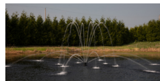
Spider & Arch