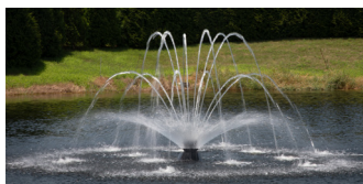
Double Arch Lily